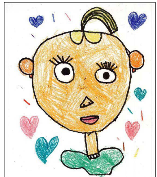
Prapthi, Susick Elementary School