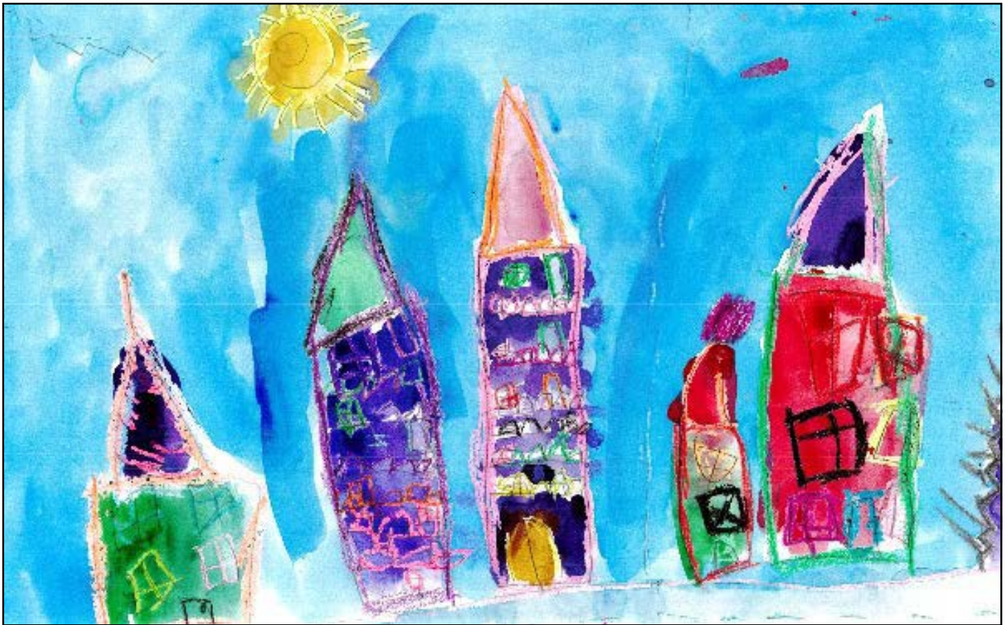
Carly, Willow Woods Elementary School