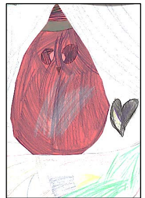
Charlie, Willow Woods Elementary School